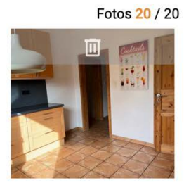
ang Vorratsraum + Diele