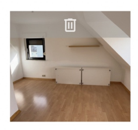
Zi.4 - DG links-Bild 2