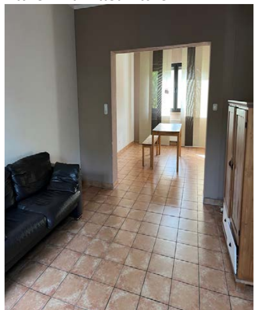
living-dining room with terrace access to the inner courtyard