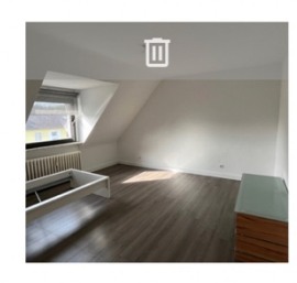
Zi. 5 - DG li. Anliegerstr.