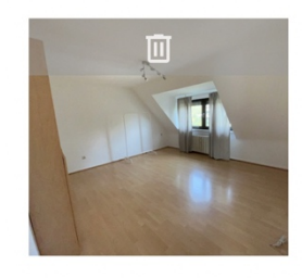
Zi. 6 - DG re. Innenhof