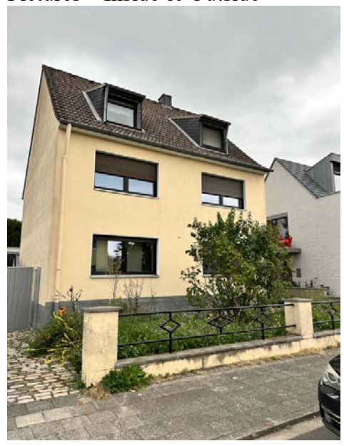
House – Street View