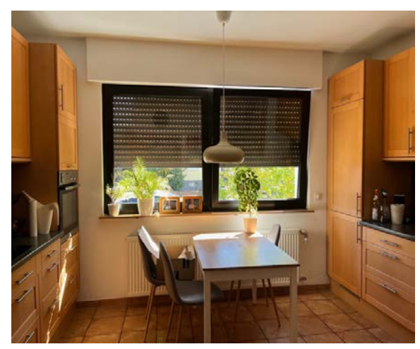
Kitchen with fitted kitchen